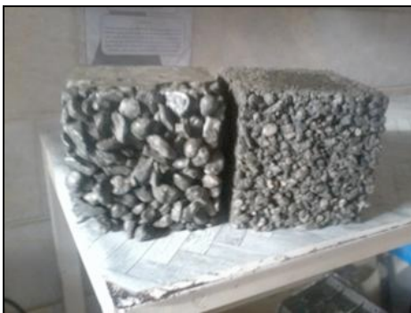
Figure 1: Samples of FPC and CPC.

All mixtures were produced using single size aggregate and only Portland cement and water-to-cement ratio (W/C) of 0.28, 0.3, 0.32, and 0.34. 1400kg aggregates were used for making one cubic meter of PC mixes. The W/C was incrementally changed from 0.28 to 0.34. In this way, Samples of different porosity were obtained. PC mixes was made from fine aggregates was named fine porous concrete (FPC), and PC mixes was made from coarse aggregates was named coarse porous concrete (CPC). All Mixtures were proportioned to achieve appropriate permeability coefficient and porosity. Standard 150mm cubic sample were used for 28-day compressive strength tests on hardened PC. All specimens were de-moulded after 24h and stored in the curing room at approximately 95% relative humidity. The compressive strength was reported based on the average of three samples. Picture of FPC sample and CPC is shown in Figure 1.