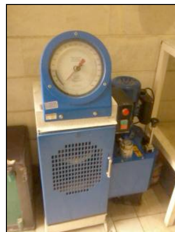
Figure 2: kit for compressive strength measurement.

Where p is the total porosity of the PC (%), w_1 is the PC sample weight air-dried for 24h (kg), w_2 is the PC sample weight submerged under water (kg), v is the PC sample volume ( \text{mm}^3 ), and \rho_w is density of water ( \text{kg}/\text{mm}^3 ).